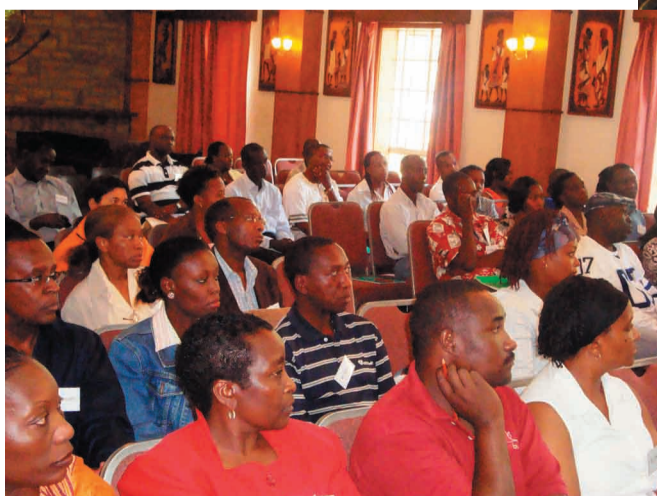
Standard 1 Parents' Seminar