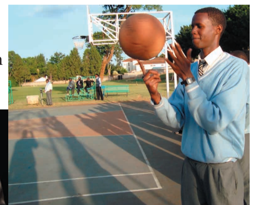
A fun spin